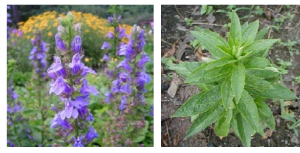
Great Blue Lobelia: Flower and Leaves