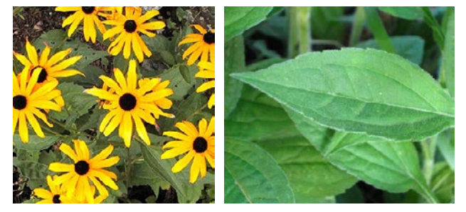
Black Eyed Susan: Flower and Leaves