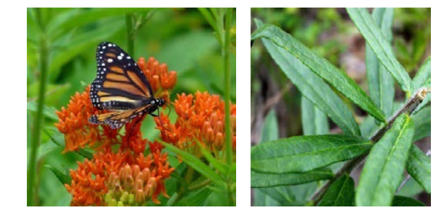
Butterfly Weed: Flower and Leaves