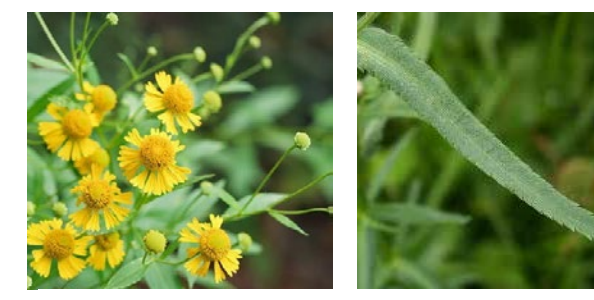
Sneezeweed: Flower and Leaves