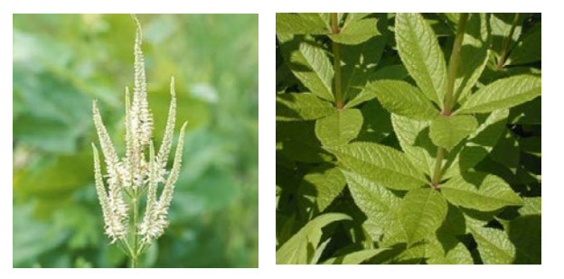
Culver's Root: Flower and Leaves