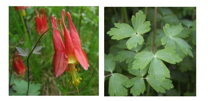
Wild Columbine: Flower and Leaves