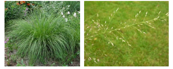
Prairie Dropseed: Full-Grown Plant and Leaves