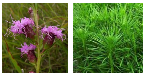
Dwarf Blazing Star: Flower and Leaves

Pale Leaved Sunflower: Flower and Leaves