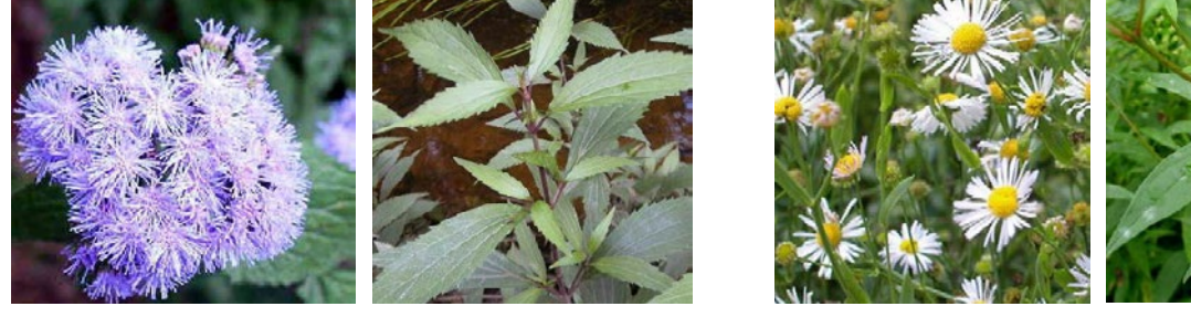
Mist Flower: Flower and Leaves