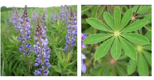
Wild Lupine: Flower and Leaves