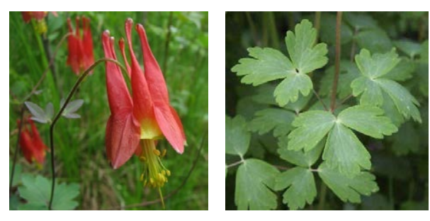
Wild Columbine: Flower and Leaves