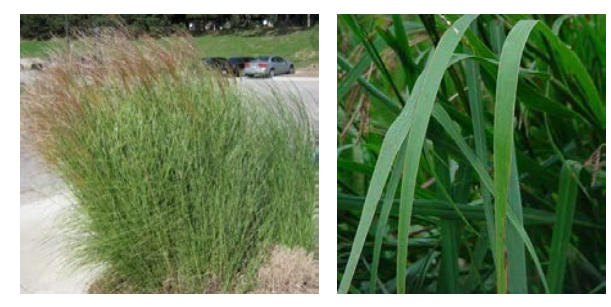
Switch Grass: Full-Grown Plant and Leaves