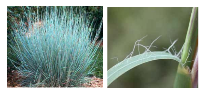
Little Bluestem: Full-Grown Plant and Leaves