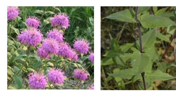
Wild Bergamot: Flower and Leaves