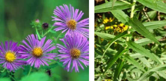
New England Aster: Flower and Leaves