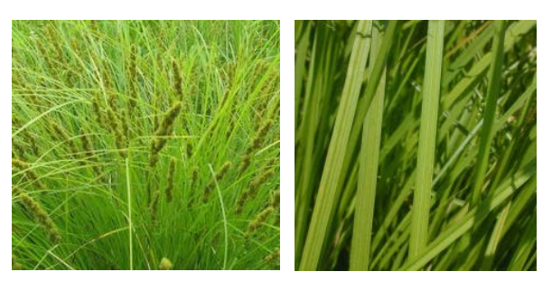
Fox Sedge: Full-Grown Plant and Leaves