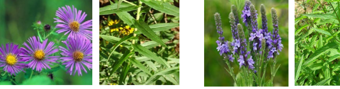
New England Aster: Flower and Leaves