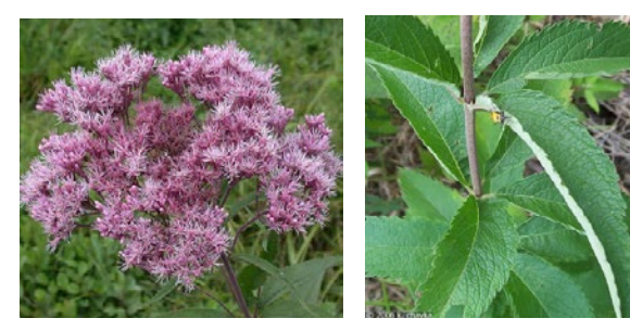
Spotted Ioe Pve Weed: Flower and Leaves