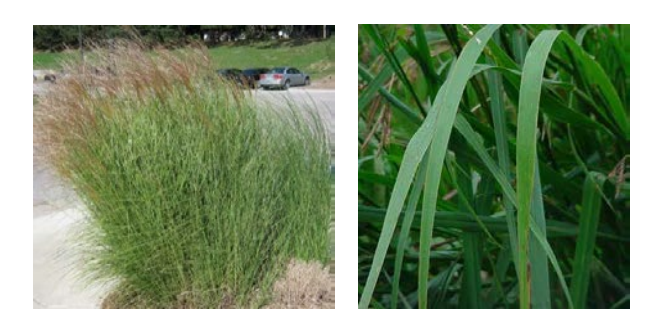
Switch Grass: Full-Grown Plant and Leaves