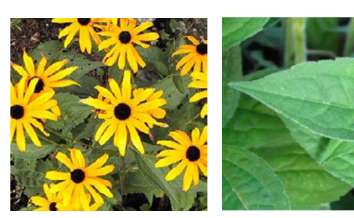
Black Eyed Susan: Flower and Leaves