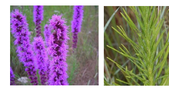
Prairie Blazing Star: Flower and Leaves