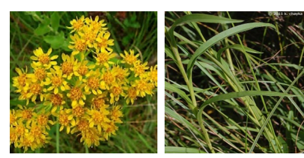
Riddell's Goldenrod: Flower and Leaves