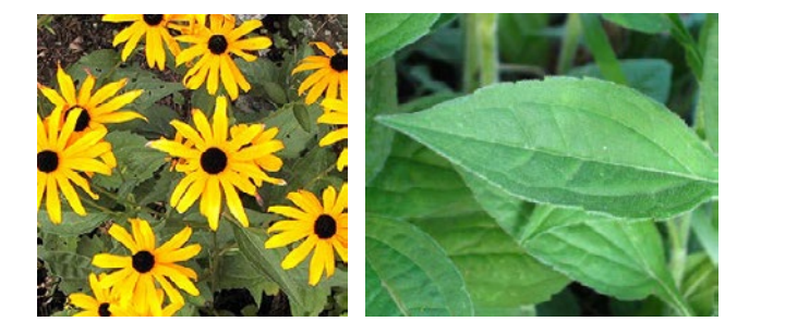
Black Eyed Susan: Flower and Leaves