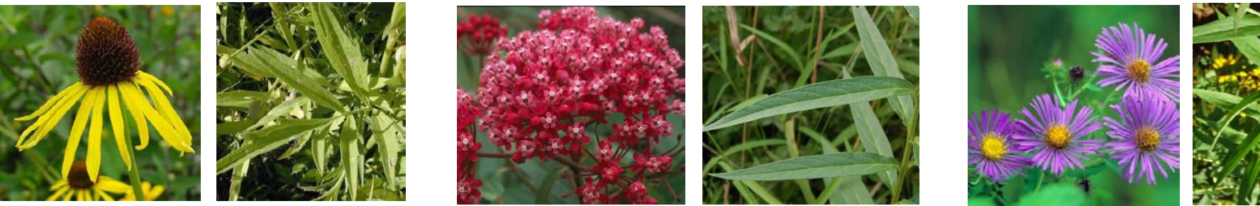
Yellow Coneflower: Flower and Leaves