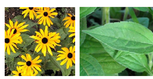
Black Eyed Susan: Flower and Leaves